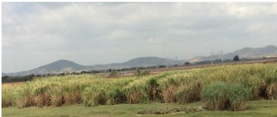
Figure 2. Partial view of the Napier grass field genebank in Debre Zeit (Ethiopia).

a Breeding lines; b Includes 2 cultivars 'Mott' (=PI517947) and 'Kizizi'. ILRI14983 may = PI667853; c 11 duplicates of ILRI accessions, not actually from Ethiopia, and none of the 12 are available; * Native distribution taken from [13]; ** Number of accessions from the forage registry, except for Brazil, United States Department of Agriculture (USDA) Germplasm Resources Information Network (GRIN), ICRISAT and RBG (Genesys [37]); *** Some of the accessions listed here are in fact duplicated between the collections (for example 20 of the ILRI collection are part of the Brazilian collection); 1 Brazilian Agricultural Research Corporation (EMBRAPA, Empresa Brasileira de Pesquisa Agropecuária ); 2 Most USDA accessions not available; 3 Millennium Seedbank, Royal Botanic Gardens (RBG), Wakehurst Place, UK. ILRI: International Livestock Research Institute; CIAT: International Center for Tropical Agriculture.