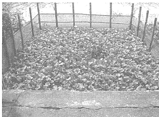
Fig. 2. View of the study site seven weeks after cultivation