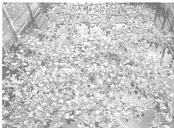
Fig. 1. Study site during the first week of cultivation

A Sampler of one square meter was constructed which could be placed on the Water Hyacinth mat delineating one square meter sample area. The plants in the sample area were removed and washed with running water without damaging to delicate roots. The plants were then air dried for several hours and later oven dried at 105 °C for 48 hours until constant dry weight obtained.